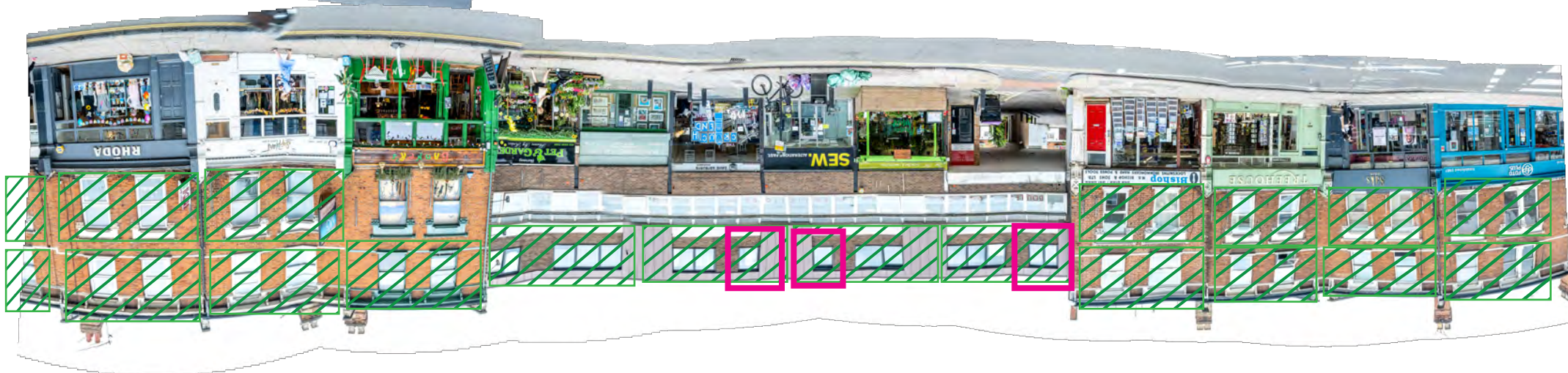
Residential Density along Park Road Above, beside, and across from Kiss the Sky Street level perspective